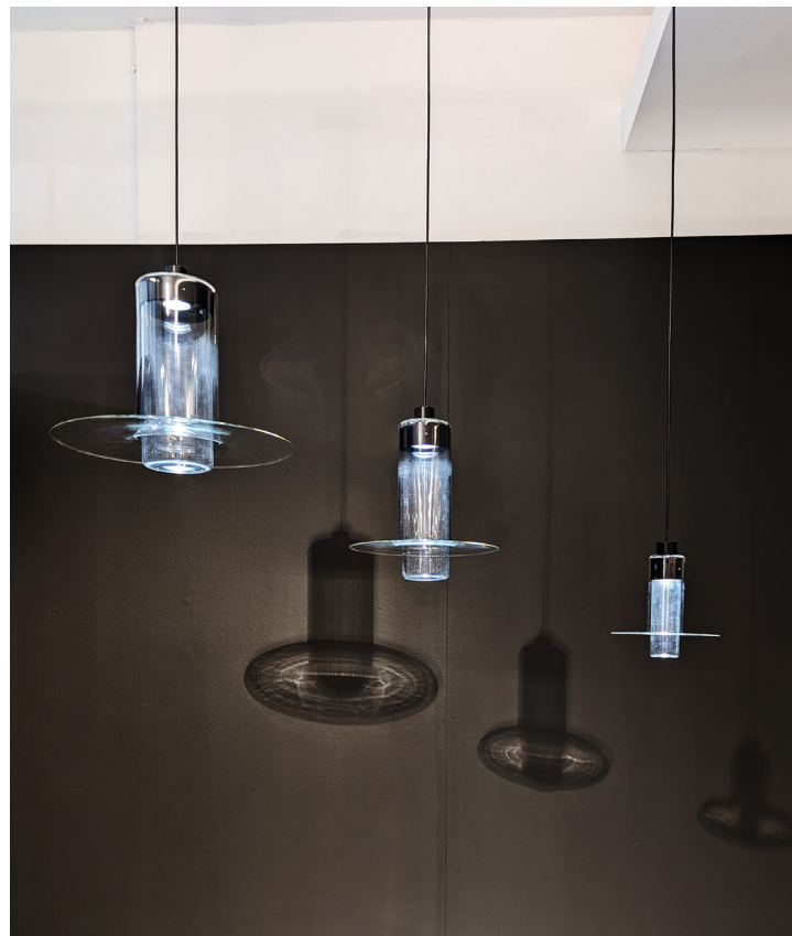
JOHN PAWSON SLEEVE PENDANT