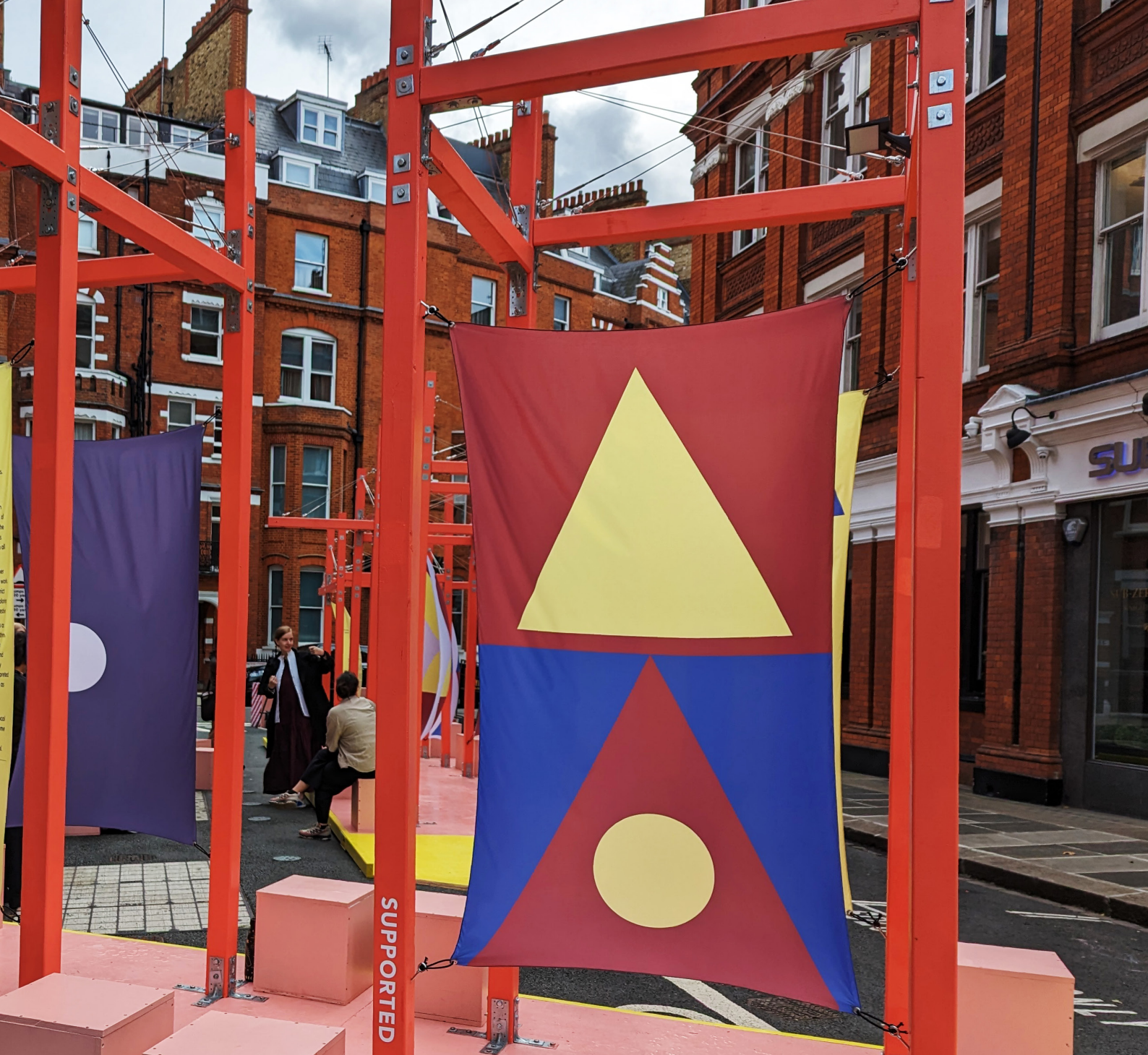
All Together by design collective All in Awe at Egerton Gardens

“All Together” is an installation by the non-profit organization All in Awe, supporting local charities. It conveys how design can ignite empathy and camaraderie, stemming from themes of loneliness and togetherness.