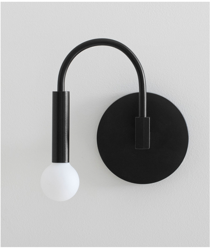
NASH MARTINEZ COLLECTION ARCH SCONCE ROLL & HILL