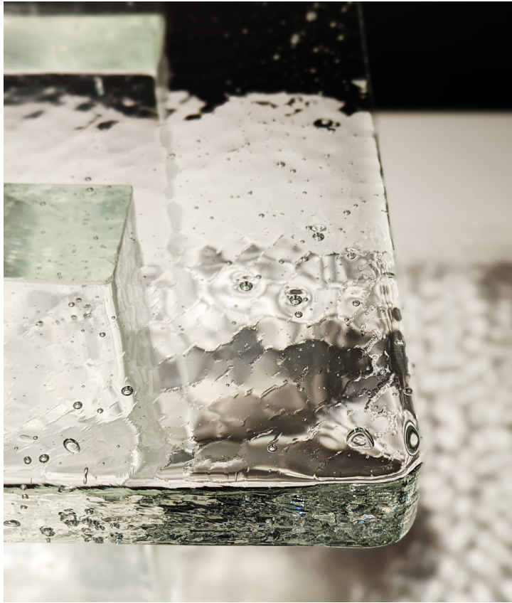
JOHN PAWSON BERG TABLE