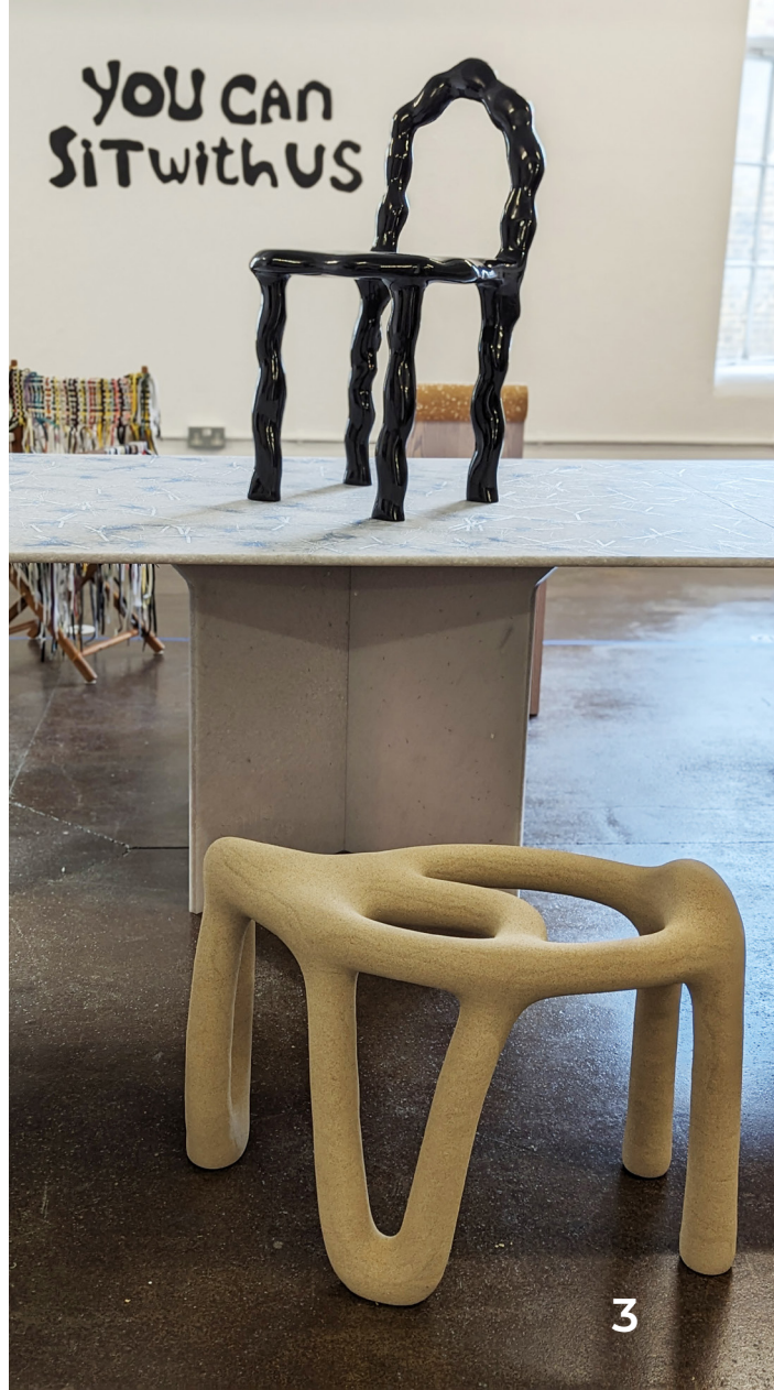
1. Generative Ceramic Morphologies, Spectroom & Digital Craft DVF