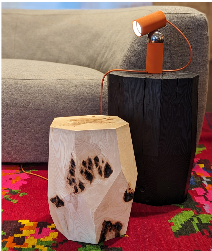
SARAH KAY HEW STOOL / SIDE TABLE SCP EDITIONS