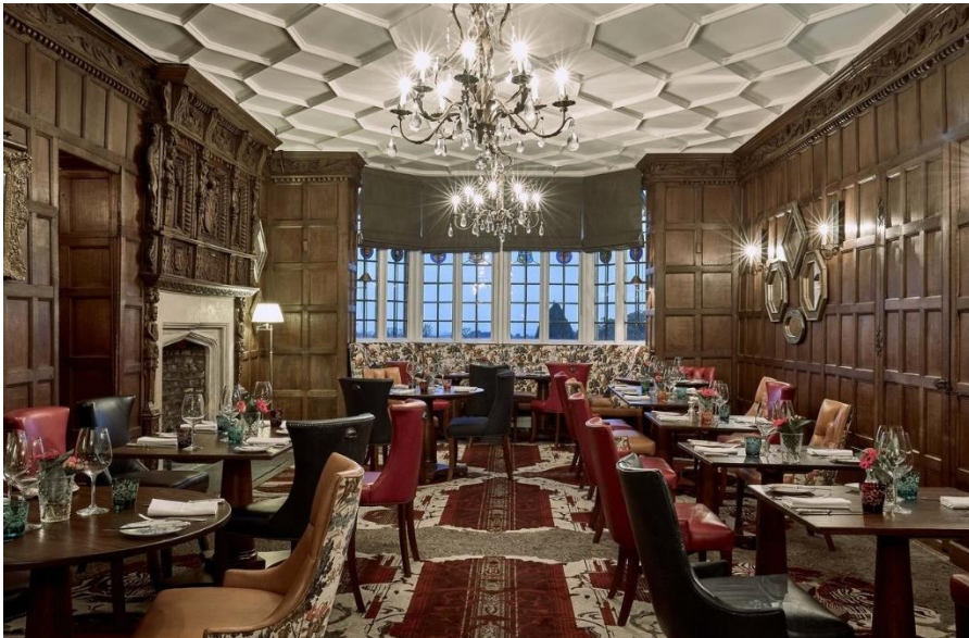
Restaurants and Bars