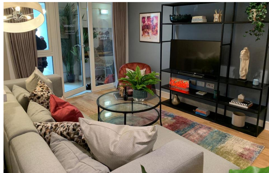
Show Homes / BTR