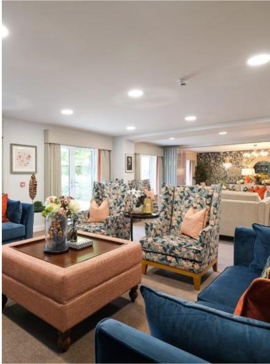
Care and Retirement