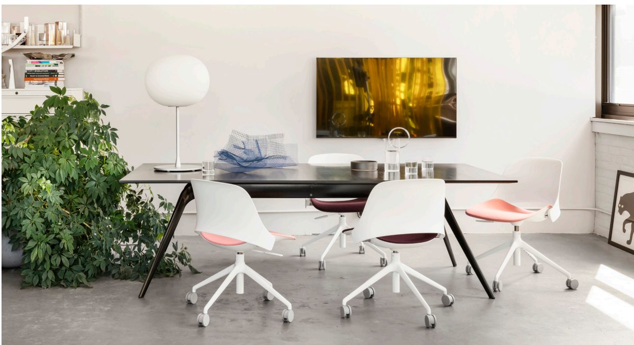
Trea Lite Task, Steelcut Quartet 0534 and 0684