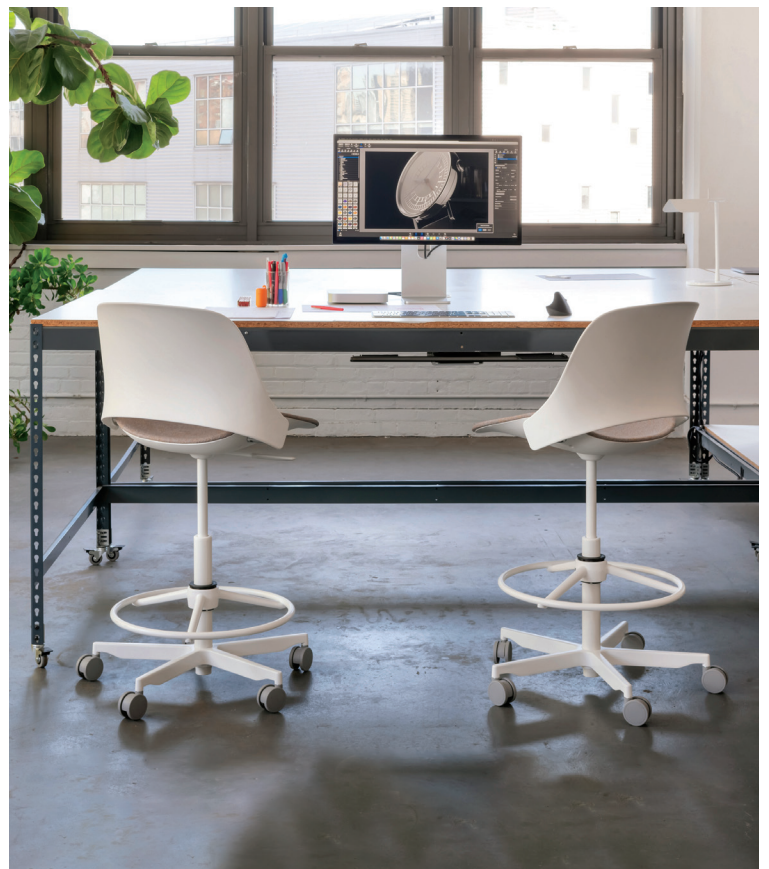
Trea Lite Task Stool, Arda 0201

Minimalist design lends true versatility without sacrificing comfort, style, or first-class functionality.